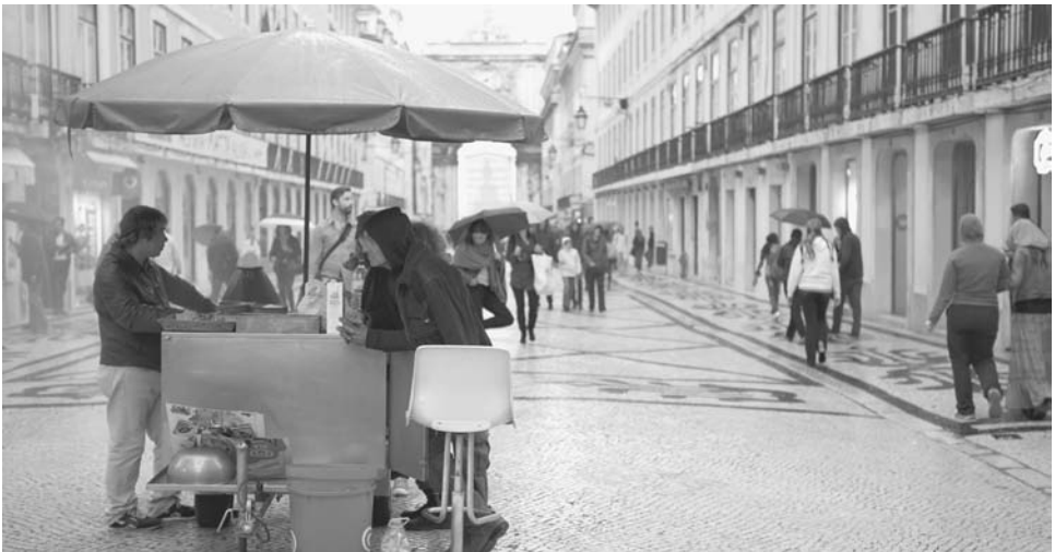
Typical street chestnut seller and customers in Rua Augusta, Lisbon.

Any reference to street food in Portugal needs to include the winter favorite: castanhas-assadas —charcoal-roasted chestnuts sold by hawkers in the city streets. In summer, the preference is for ice creams and farturas : a traditional Portuguese doughnut formed in long spirals that are cut up into long pieces. Farturas are a favorite not just in the city but also in regional fairs where they are sold still piping-hot sprinkled with a mix of sugar and cinnamon. Farturas are a culinary trace of